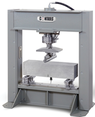
CMOD testing to EN 14651 with 200kN high stiffness frame 50-C1511/FR. See Additional Information