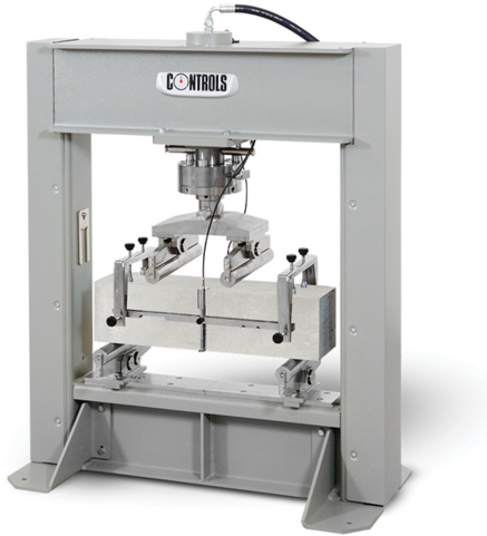
Testing FRC beams to ASTM C1609, EN 14488-3 with 200kN high stiffness frame 50-C1511/FR. See Additional Information