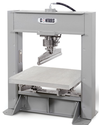
Flexure testing on concrete flagstones with 200kN high stiffness frame 50-C1511/FR.