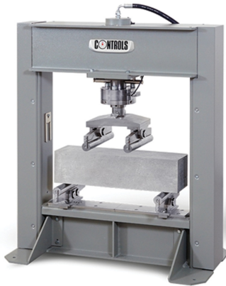
Flexure testing on concrete beams with 200kN high stiffness frame 50-C1511/FR.